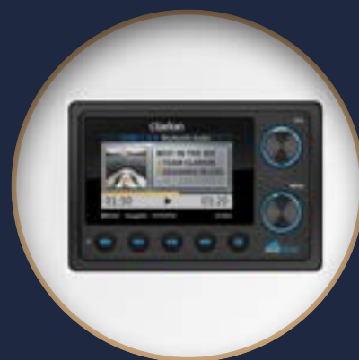
Clarion Marine CMS4 radio