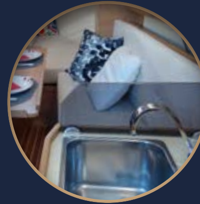
Plexi at a side of sink