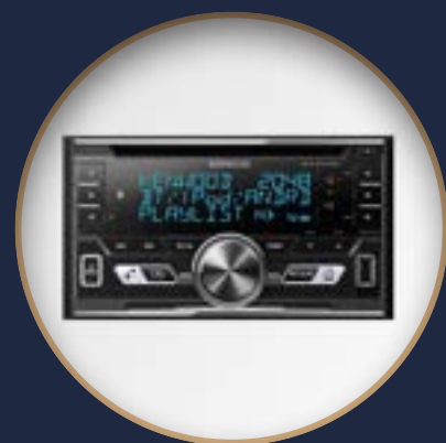
Kenwood MP3 / bluetooth radio

The audio system we offer may consist of a radio, two speakers in the mess room and/or two speakers in the cockpit. On request, we can expand the audio system with an additional subwoofer or speakers in the bow, in the stern berth or in the bathroom. With the radio, we are mounting an internal FM antenna, or a mast antenna on request. All radios we offer support MP3 format and wireless Bluetooth communication.