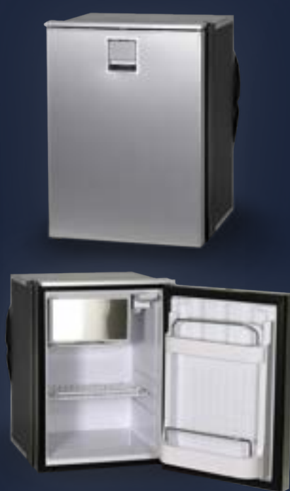
Elegance 40l - 70l