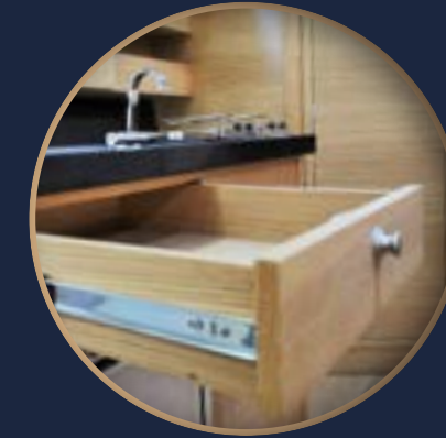
Drawer for cuttlery