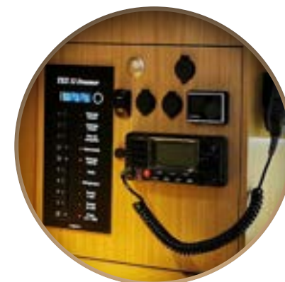
Amperflex Premium glass dashboard with micro monitor display