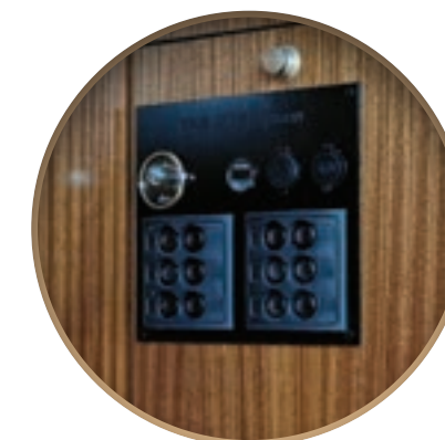
BEP board on engraved PLEXI (With unit name + holes for indicators)