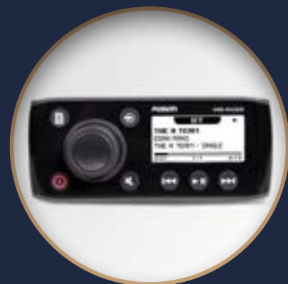
Fusion Marine bluetooth radio