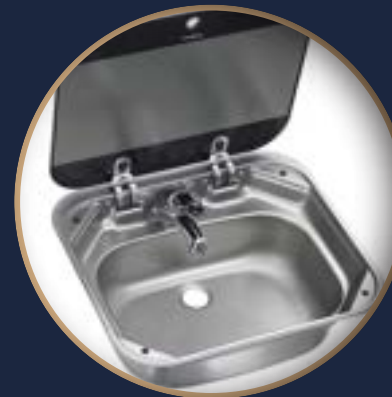
Sink under the corian type countertop