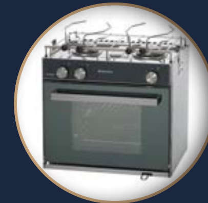
Sample of cooker with glass flap