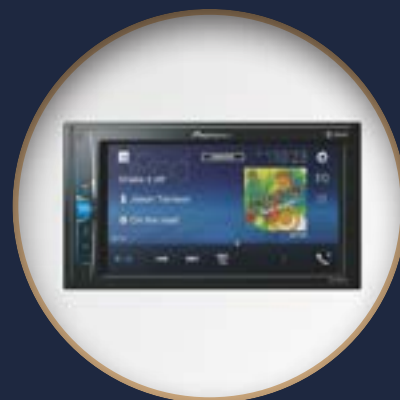
Pioneer MP3 / bluetooth radio with touch screen