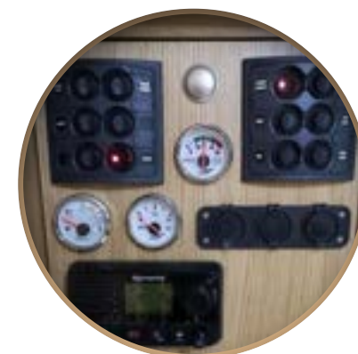
Standard BEP panels with WEMA gauges.

Depending on the number of electrical devices and indicators, we can use different layouts of buttons and indicators. The pictures above are just an example. The standard equipment includes a BEP panel with 6 buttons + WEMA indicators and sensors