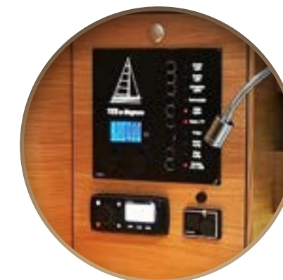
Amperflex Premium glass dashboard with micromonitor display, hydromagnetic fuses and boat engraving.