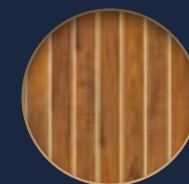
Light stripe floor