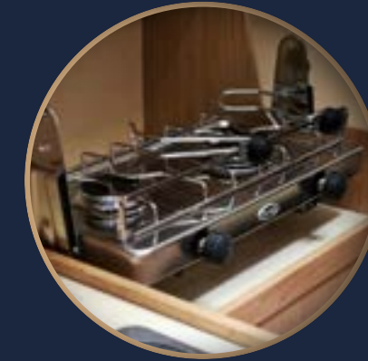
Cooker on cardan joints