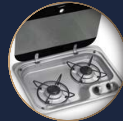
Oven on cardan joints